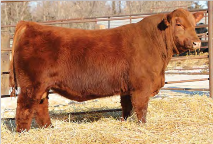
RREDS PIONEER 6904