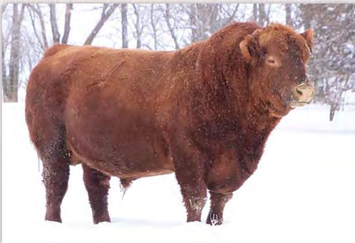
PIE CINCH 4126