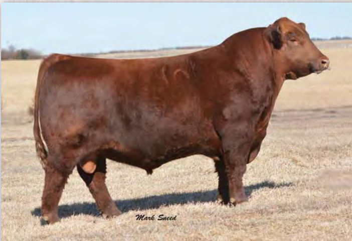
PIE THE COWBOY KIND 343

A PIE THE COWBOY KIND 343 Birth Date: 2/8/13 Category: 1A 100% BW: 83 WW: 810 YW: 1413 #1651710