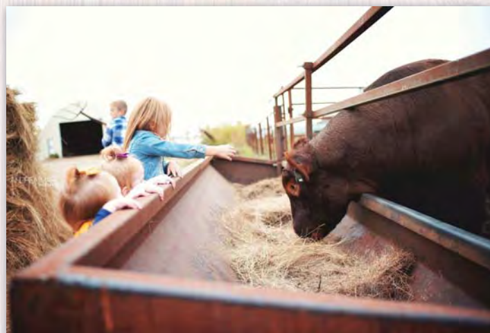
Kids feeding Up Front

A full sibling by Seneca and 0T43. Moderate bull that has a real nice pattern.