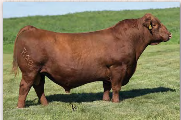
Bieber Hard Drive Y120, maternal grandsire