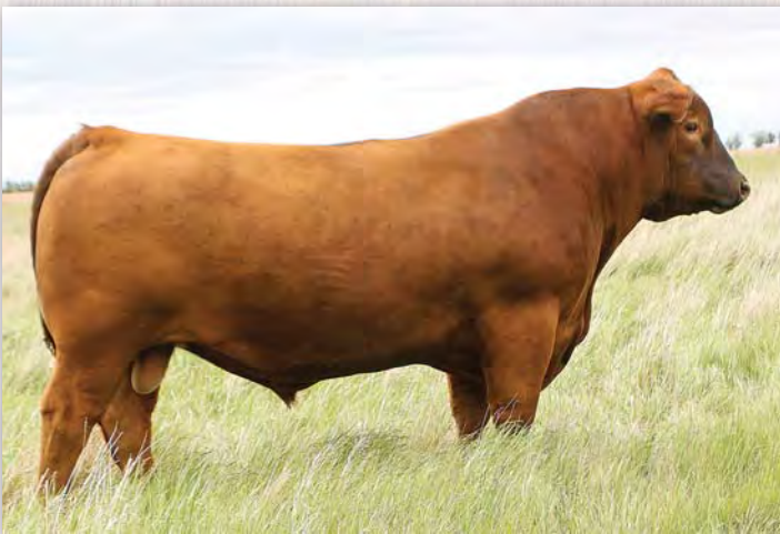
LACY PAYLOAD 1120 023C

B LACY PAYLOAD 1120 023C Birth Date: 3/22/15 Category: 1A 100% BW: 81 WW: 691 YW: 1195 #3470037