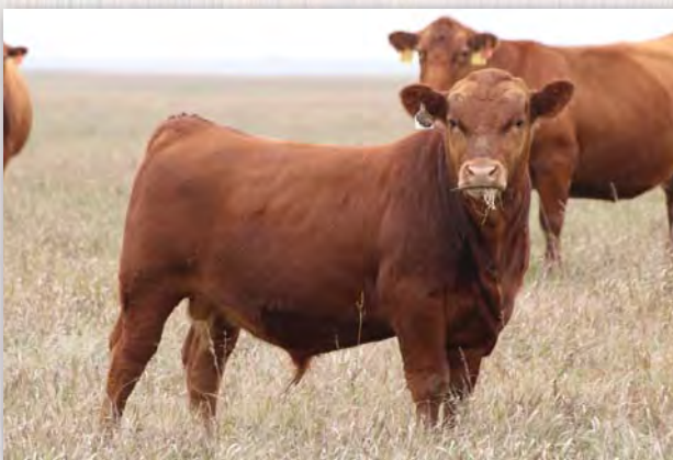
Lot 3 in August

This bull's mother has been an anchor in our program since the beginning. She is sure-fire calving ease and will leave you daughters with flawless udders and kind. We have raised several full and half siblings to this bull and there isn't much you would change about them.