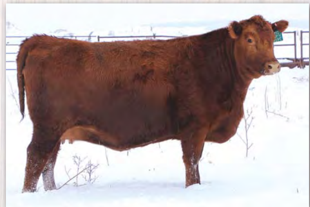
Full sister to Lot 3 and Lot 11