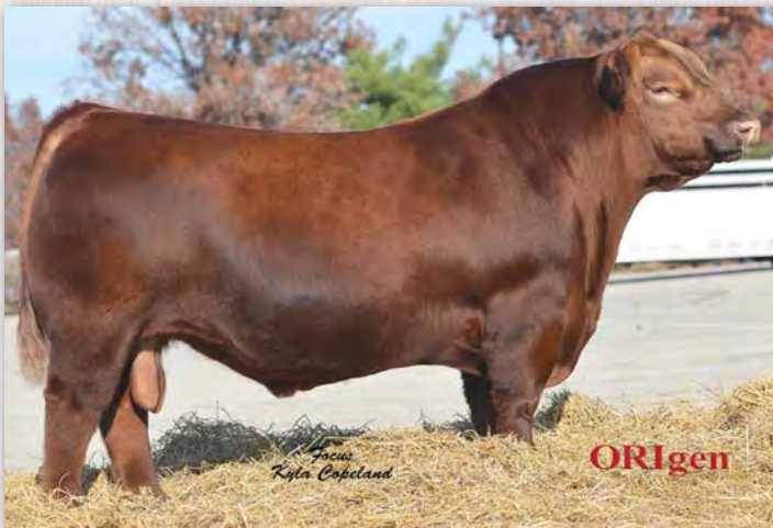
SILVEIRAS MISSION NEXUS 1378