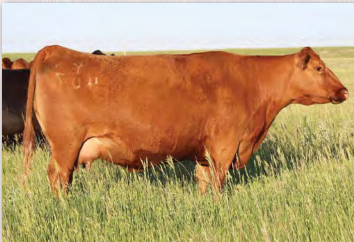
Y407 Donor at 11 years of age