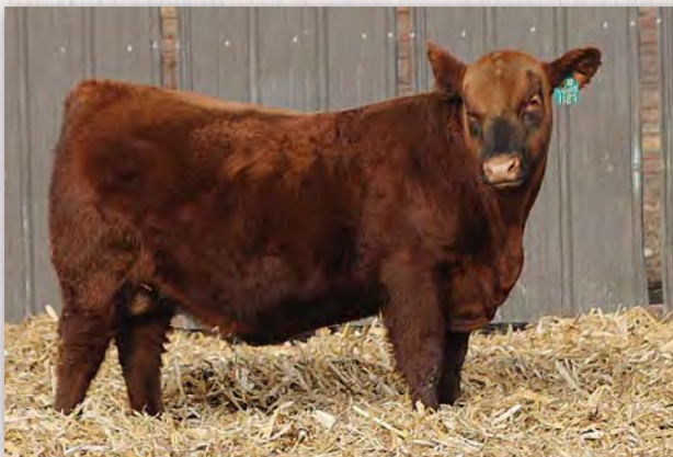
Lot 1 in December

We are excited to be starting the sale this year with this herd bull prospect. He is the lead-off Seneca son and is pretty hard to fault. He is probably the best bull we have yet to produce. The bull has just a bit more frame than his sire but still expresses the muscle pattern of his littermates. He is good footed, smooth fronted and really has that herd bull character. His cow family always breeds on time and are very functional. We will use this bull in our program via AI and embryo transfer work.