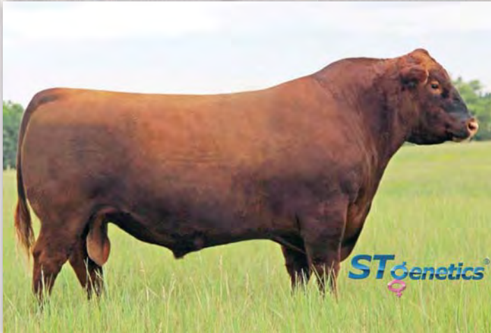
PIE JUST RIGHT 540