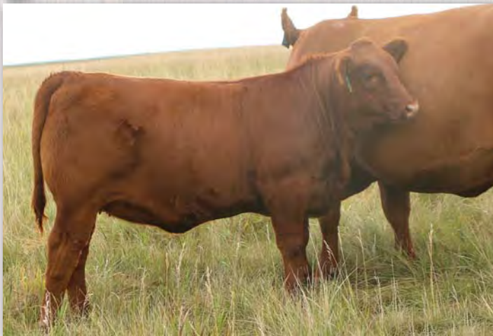
Seneca daughter by Hard Drive