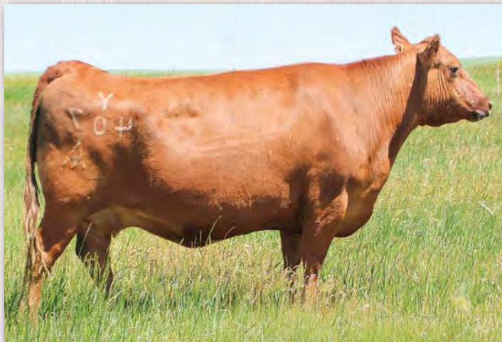
Basin Primrose 4167

Full sibling by Seneca and 0T43. Moderate framed with a great muscle pattern.