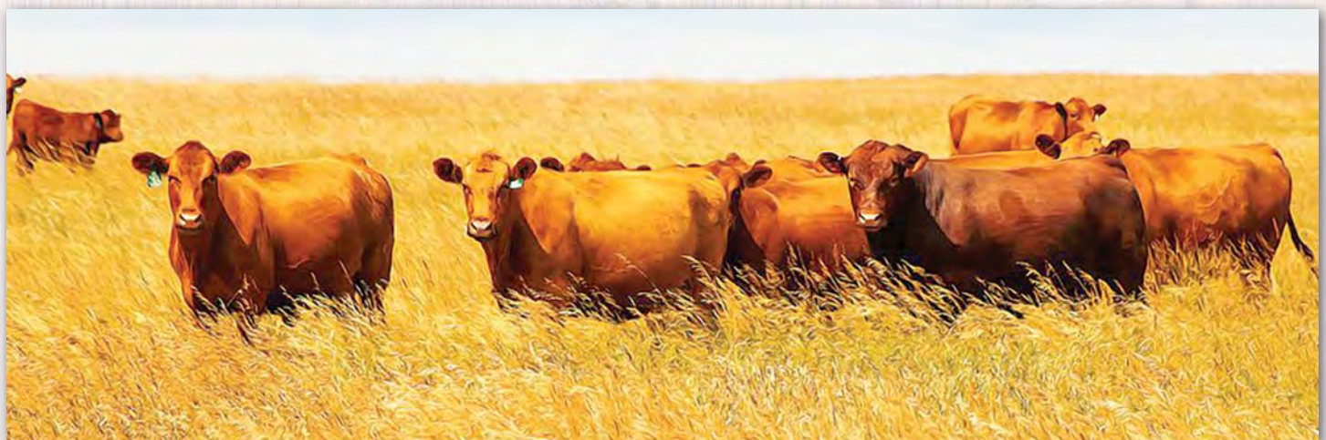
Upfront and his breeding group