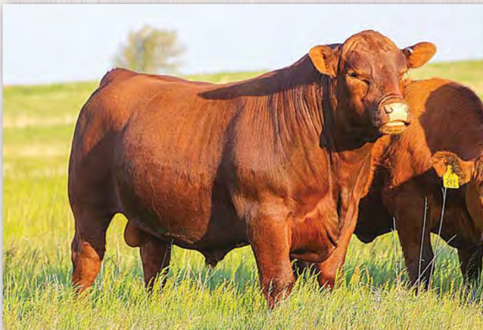
PIE UP FRONT 508