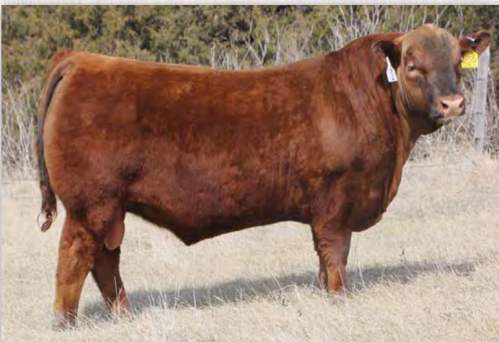
RREDS SENECA 731C

C RREDS SENECA 731C Birth Date: 3/1/15 Category: 1A 100% BW: 74 WW: 974 YW: 1448 #3491307