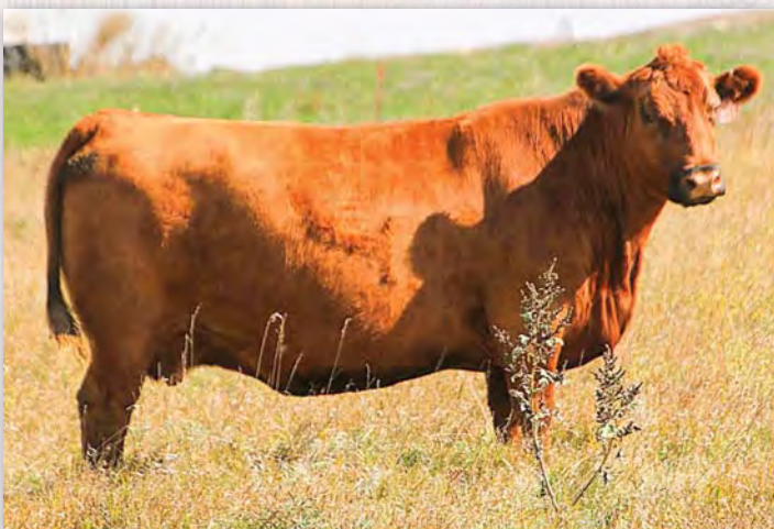
MLK CRK LAKOTA 095, dam of Lot H-2