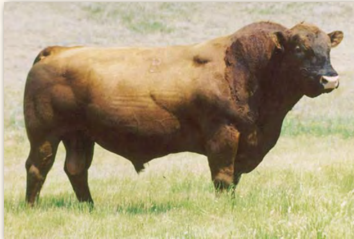
GLACIER CHATEAU 744