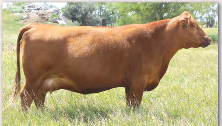
RREDS PRIMROSE 420B, dam of Lot 12

One of many sons selling by this foundation dam stemming from a cow family that is very prolific and productive. A balanced bull with breed-leading character. Lots of potential here. Could be used on heifers in the right situation.