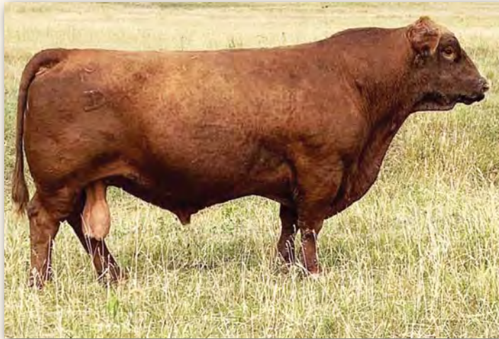
RED MINBURN COPENHAGEN 3Y

K RED MINBURN COPENHAGEN 3Y Birth Date: 2/5/11 Category: 100% BW: WW: YW: #2400918