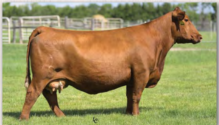
RREDS LANA 402B, dam of Lot 1