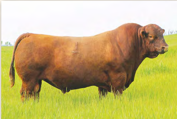
PIE CINCH 4126