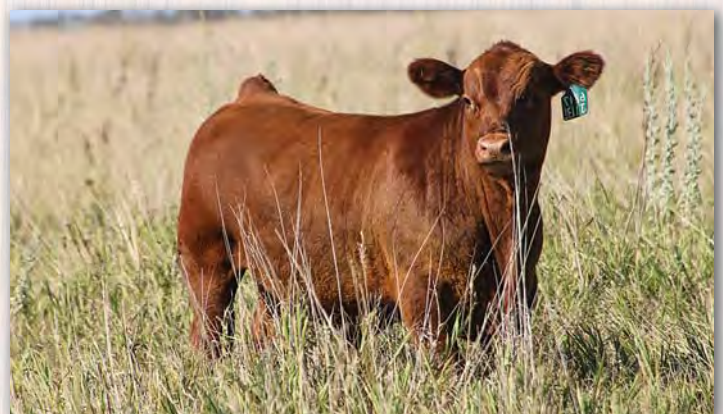
Lot 5 in August

Affectionately known as Gus, this Common Sense son is a younger bull in the sale and shouldn't be overlooked. He is complete in nearly every way. Gus checks a lot of boxes and provides the balance we need more of in this business. His mother is a full sibling to Pioneer and a cow that is starting her career off right doing a great job on the ranch.