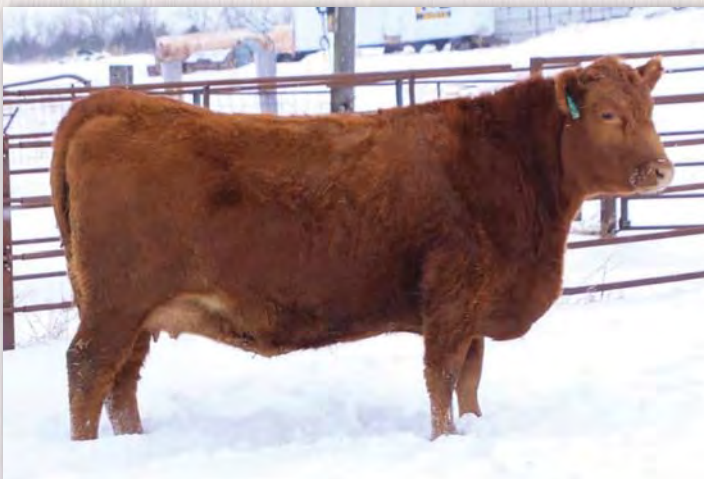
RREDS PRIMROSE 7166, dam of Lot H-1

Up to 100 free AI arm services sell separately to be used in conjunction with any raised or owned Rhodes herd sire with semen inventory on hand.