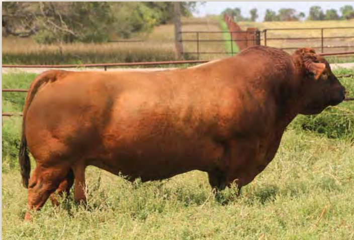
RREDS SENECA 731C