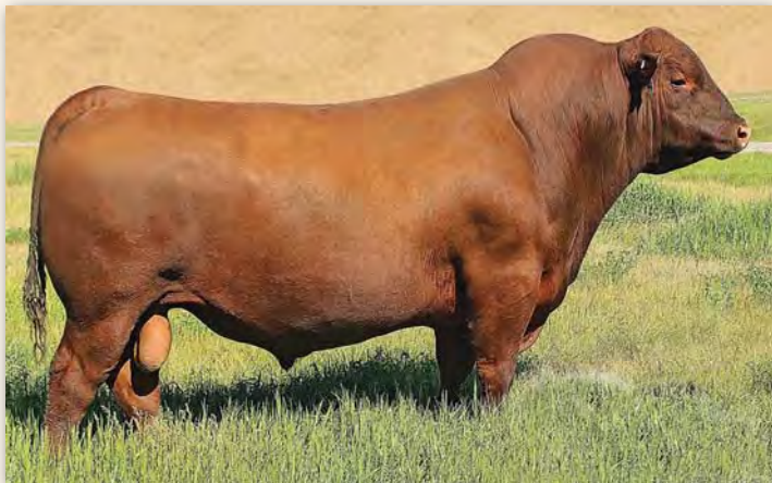
BIEBER LET'S ROLL B563