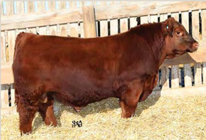
RED U-2 RENOWN 193C