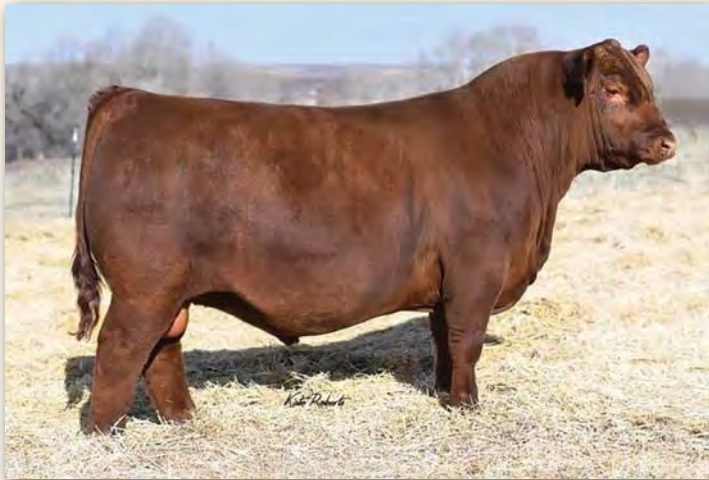
RED U2 TOWNSHIP 17G