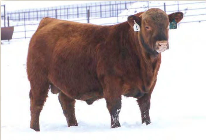
RREDS COMMON SENSE G933