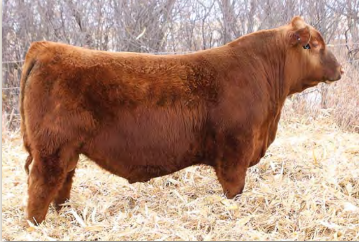
RREDS OCEAN FRONT PROPERTY