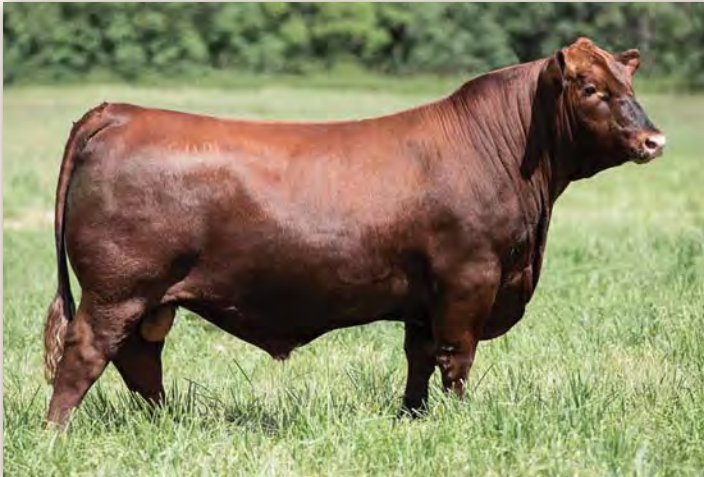
RED U2 BLUE COLLAR 295E