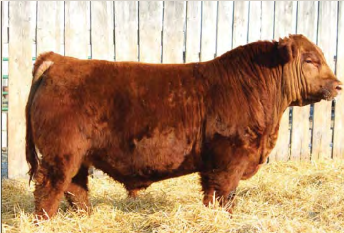
RED MRLA RESOURCE 137E