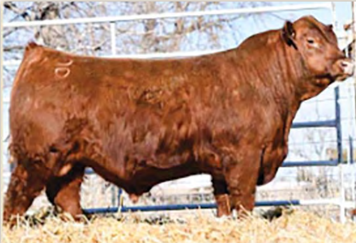
DVO X`S AND O`S G180