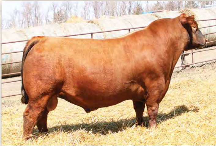
RREDS PATHFINDER F811