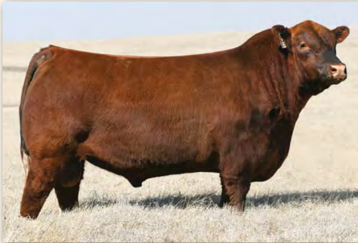
MANN RED BOX 55C