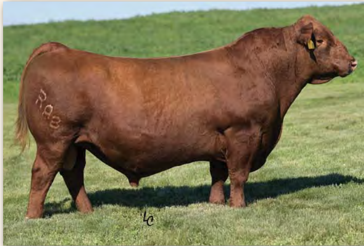
BIEBER HARD DRIVE Y120