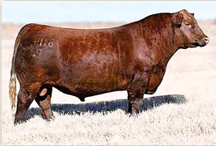
DUFF RED BLOOD 18114